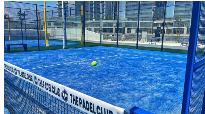
Padel Club Dilmunia

15% discount for Nadeen Students, parents & staff