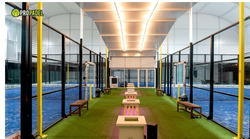
Pro Padel Hidd